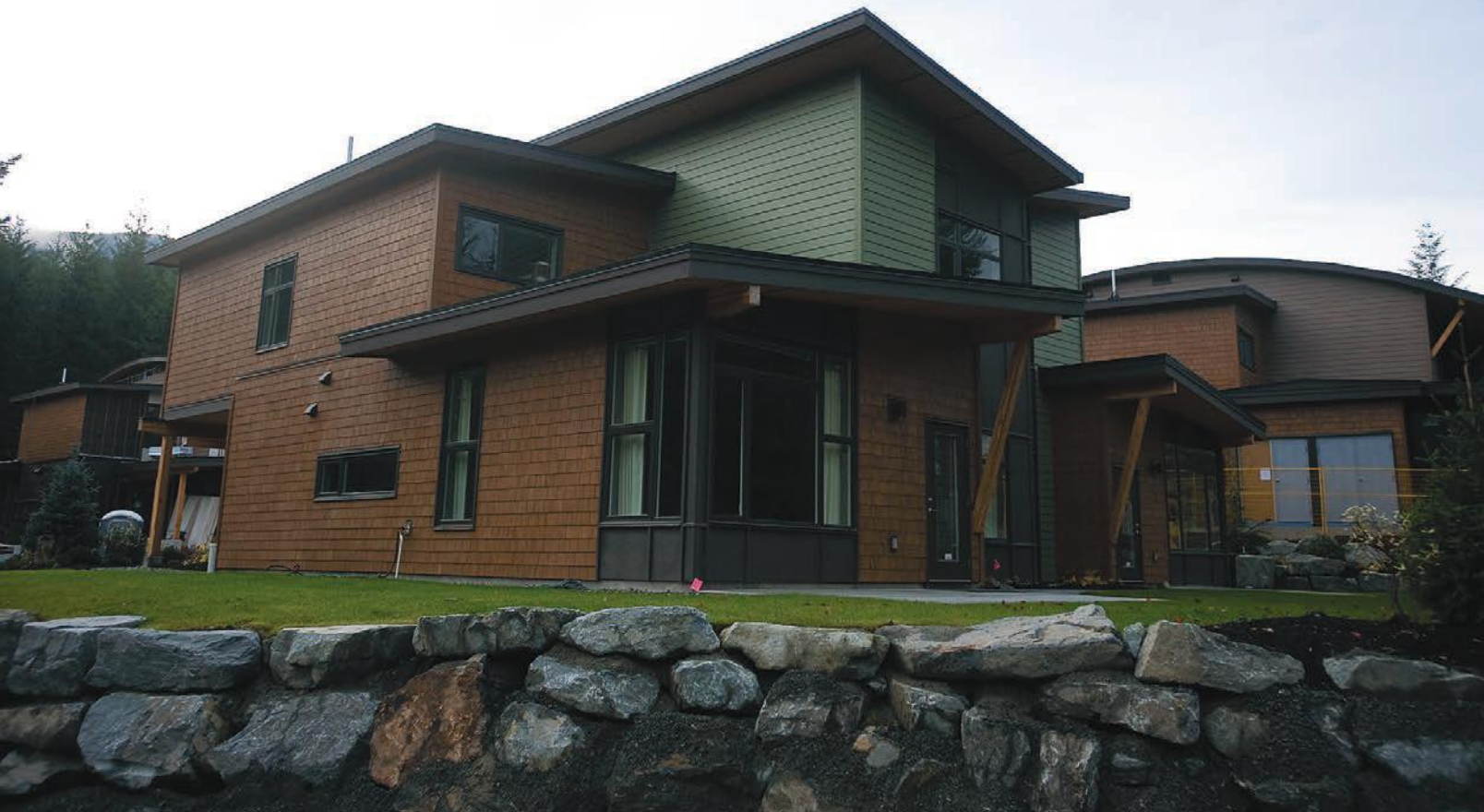
The Olympic and Paralympic Village in Whistler illustrated Environment Canada's role in sustainability of 2010 Games.

There were several components of the Government of Canada's role in the sustainability of the Games.