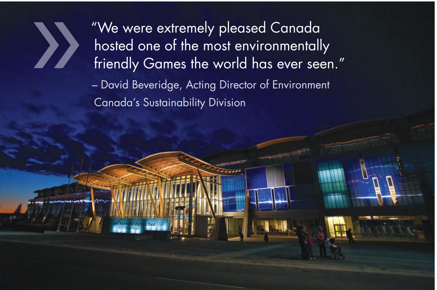
The Richmond Olympic Oval, the competition site for speed skating at the 2010 Winter Olympic Games.