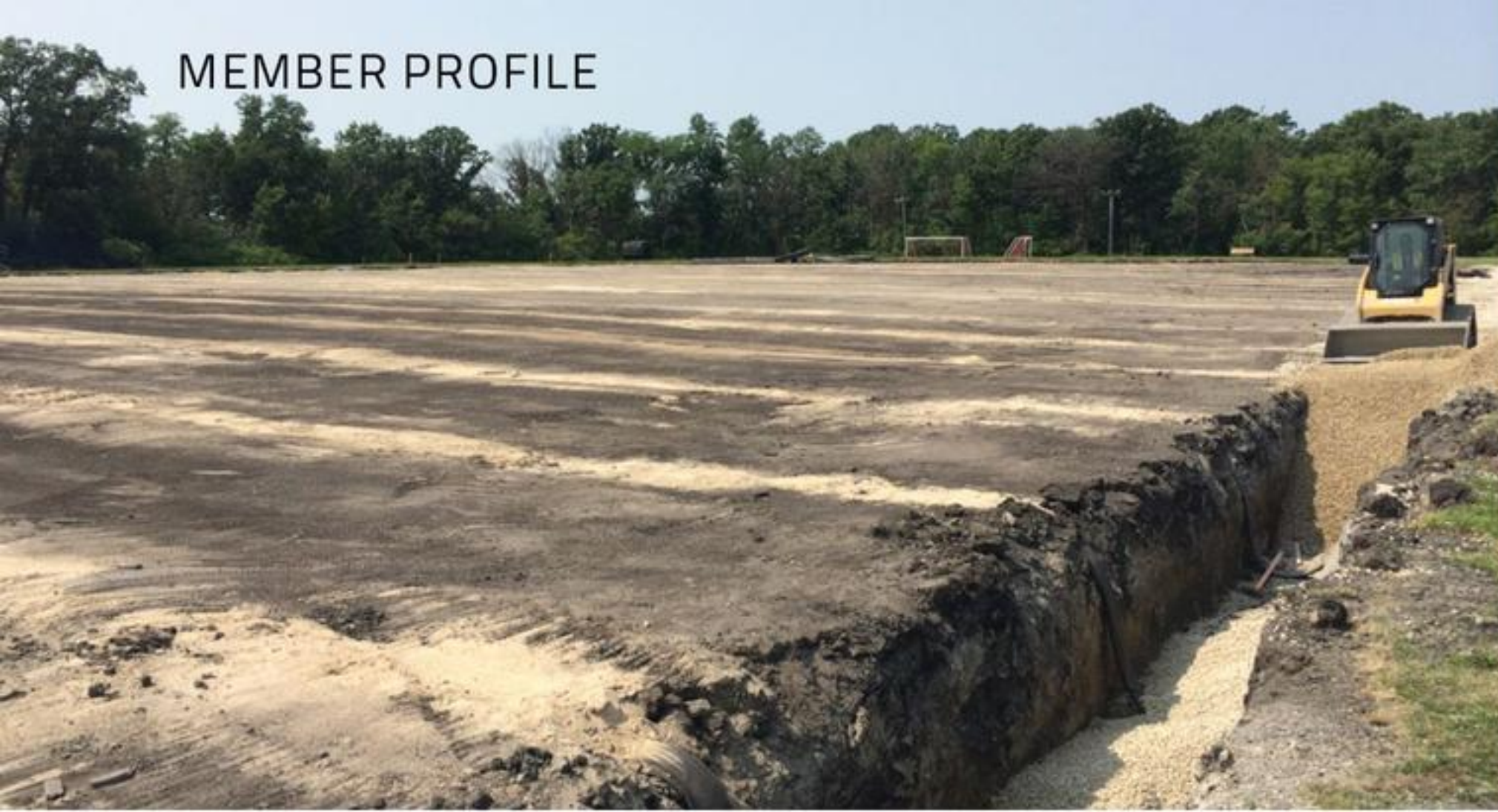
A view of the stripped field and drainage trench construction on one of two fields where FIFA Women's World Cup teams will practise