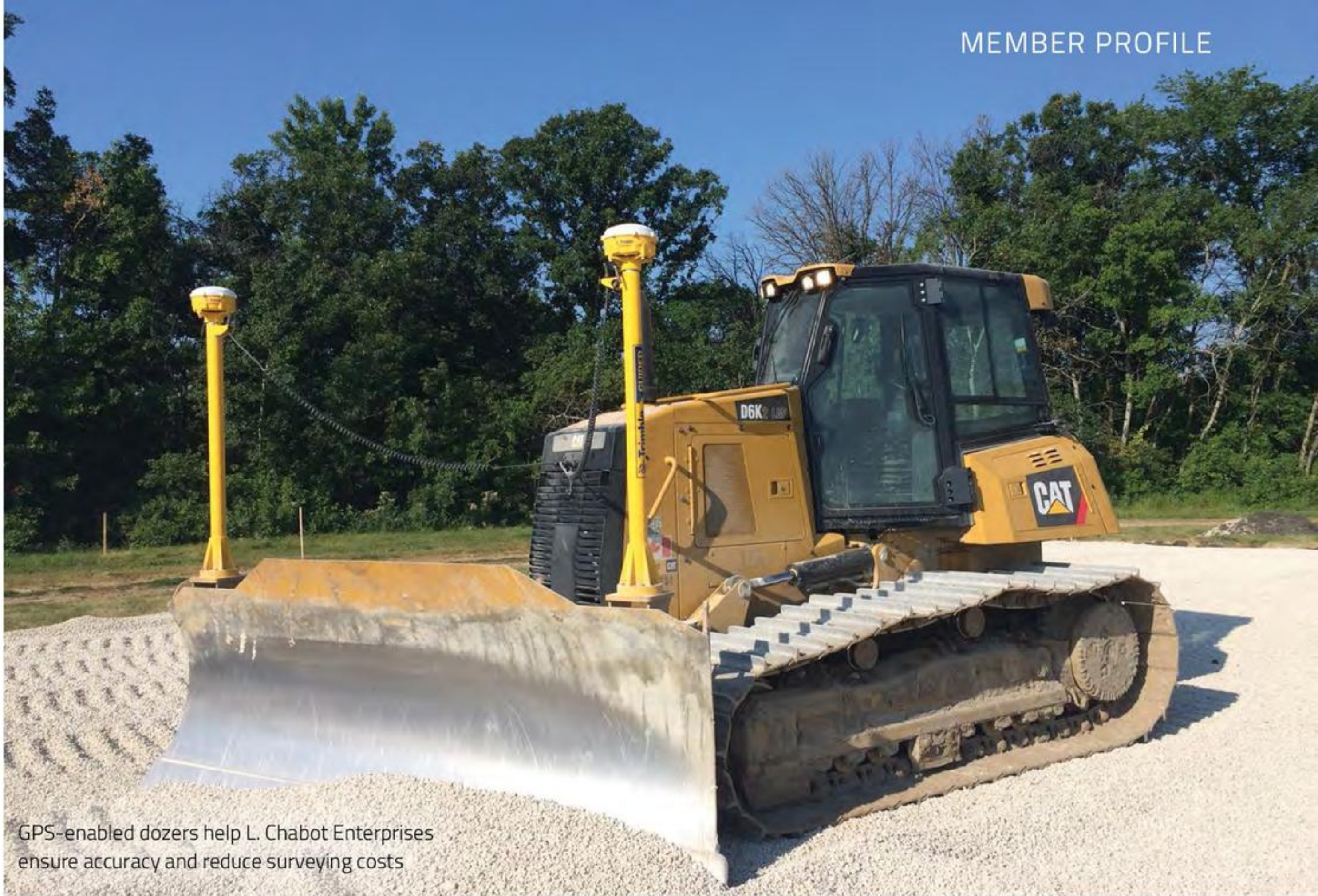
GPS-enabled dozers help L. Chabot Enterprises ensure accuracy and reduce surveying costs

It's this commitment to employ technology that led them to secure the Winnipeg Soccer Federation project.